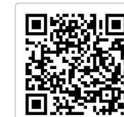
Scan to verify ZS-VAULT-2026-99120-XF